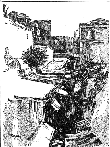
An impression in lithograph of that thoroughfare in Jerusalem traversed by the Jews of the three faiths en route to their sanctuaries. The Jews traverse it to reach the Wailing Wall; the Christians to the Tomb of Christ and the Mohammedans to the Mosque of Omar