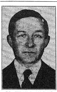
DR. JUDAH L. MAGNES