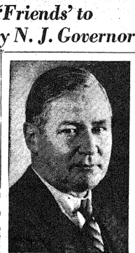
GOV. A. HARRY MOORE

A group of twenty-one Bedouin Arabs were on board, wearing native garb, but they had nothing to do with the Palestine