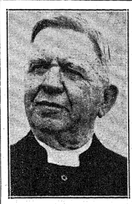
DR. S. PARKES CADMAN

Stating that the committee of Christians had been formed "at the request of James G. McDonald, League of Nations High Commissioner for Refugees," Dr. Cadman said the purpose of the new organization is "to bring to Christian