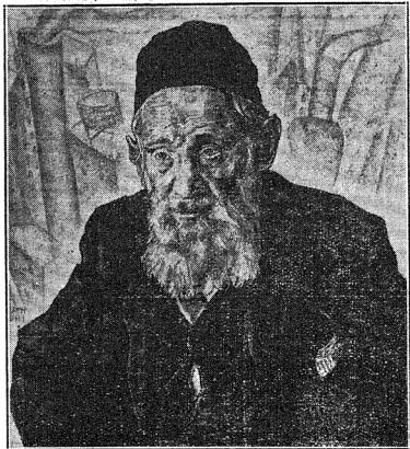
—From a drawing by Ruth Light.