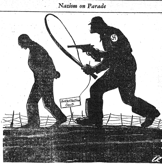
"New Germany is on parade. A stirring spectacle of progress and work. History being shaped before your eyes, in a modern, progressive country that sparkles with the spirit of Youth and thrills to the exciting events of today."—From the advertisement of a German Tourist agency. Last night the Friends of New Germany, assembling at Madison Square Garden, gave their allegiance to the kind of Germany so graphically portrayed in this cartoon by Carl Rose.