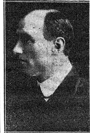
SIR PHILIP CUNLIFFE-LISTER