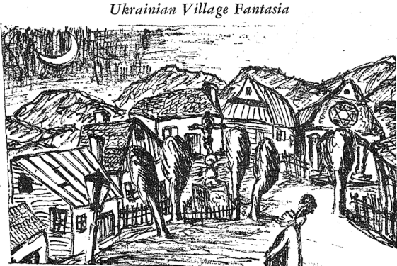
Ben-Zion Weinman vividly recalls the legend of the village cellist who serenaded all and fell asleep while playing.

(J.D.B. Special Correspondence) SYRACUSE, April 30.—With the growing strength of the Zionist movement here a special conference, represented by various groups in Zionism, was held at the