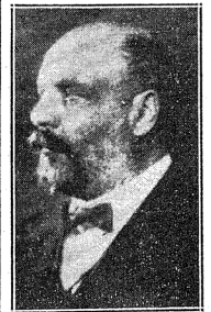
M. M. USSISHKIN