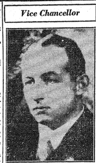
PRINCE VON STARHEIMBERG

W. Y. U. Girl Activities Dine The Jewish co-eds received special awards and sixteen were given letters at last night's annual women's athletic dinner for members of the women's teams at the