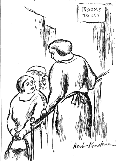
A grown up daughter is such an expense. Now we got to have a telephone put in.