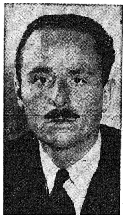
SIR OSWALD MOSLEY

Decide Propaganda Can No Longer Be Neglected, States Post