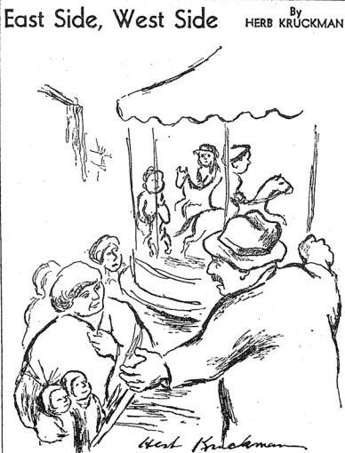
"Twins or no twins, lady. I charge a penny a piece."