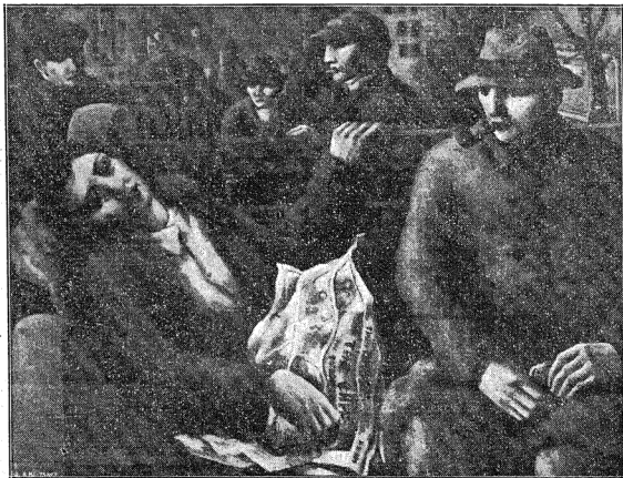
One of the paintings at the No-Jury exhibition of the Salons of America at Rockefeller Center.