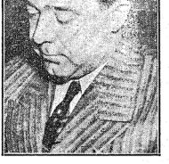
SEN. HUEY P. LONG

The women knew feminine psychology. As long as they continued to pique the curiosity of the passerby success was certain. And the record was simple. When the enterprising ladies sorted out shoes and ships and sealing wax, and asked for new bundles at the end of the first week of business, authorities were slightly startled but muttered beginners' luck.