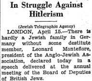
FELIX M. WARBURG

Polish Officials Ban Revisionist Parade; No Reason Is Given (Jewish Telegraphic Agency) WARSAW, April 15.—Polish authorities today prohibited a Revisionist Zionist street procession called to further the appeal for signatures for the world petition being circulated by the Revisionists. No reason was given for the ban on the parade. The petition being circulated by the Revisionists, right wing Zionists, is aimed against Great Britain, mandatory power for Palestine, and against the government of Palestine, for having adopted an immigration policy barring mass Jewish immigration into Palestine.