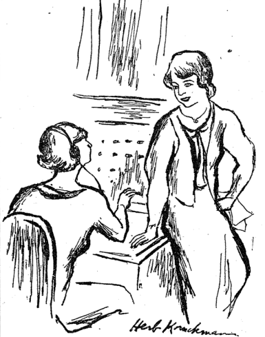
"I warned the boy friend to say he couldn't understand Yiddish so well. Then Papa couldn't spend the whole night telling him stories!"