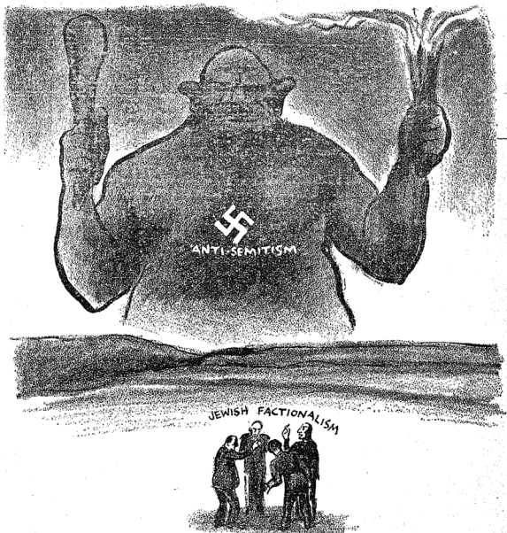
Specially drawn for the J.D.B. by Carl Rose.