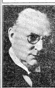
PRIME MINISTER BENNETT

To assist with the campaign in Western Canada.