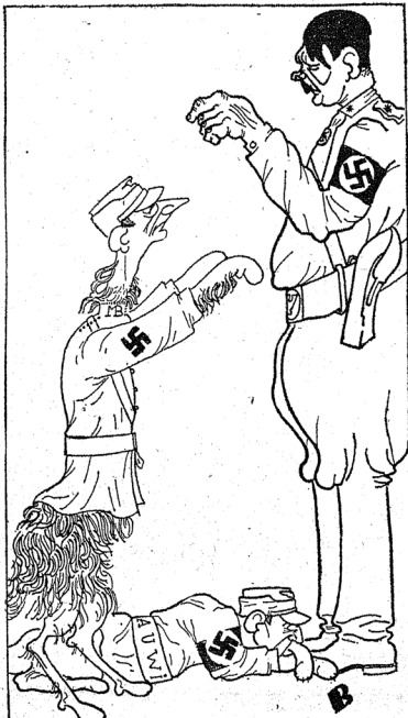
The Hobenzollern prince, having become aware of the Leader's love for dogs, are learning to be perfectly dog-like with him.