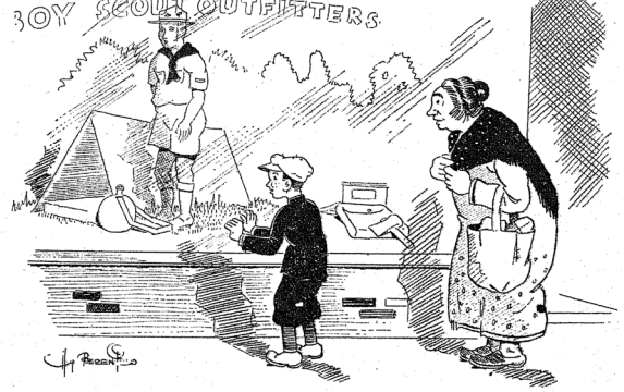
"No, Sammy, I can't afford to buy you a Boy Scout Uniform, but you can do me a good deed every day without it."