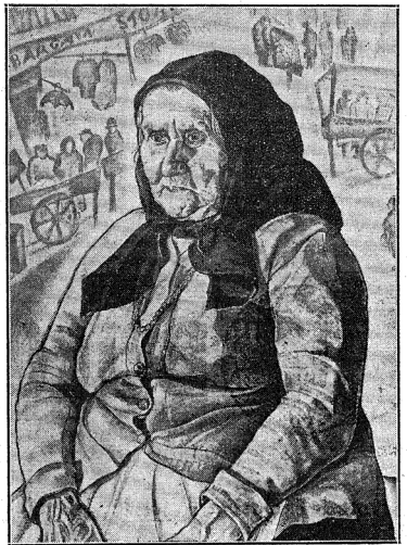
A typical East Side character, as depicted by the American painter, Ruth Light