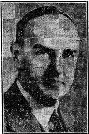
GOV. LEHMAN, NEW YORK