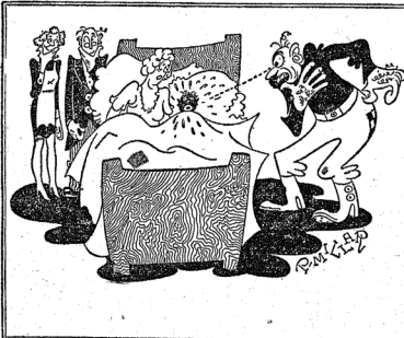
—Stanis, London "I told you you shouldn't join the Black Shirts!"