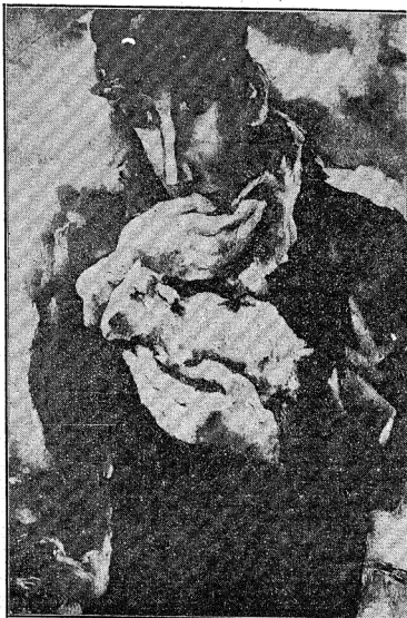
One of the episodes in "Chad Gadya," as depicted in a painting by Boris Denitch