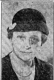
MISS FRANCES PERKINS