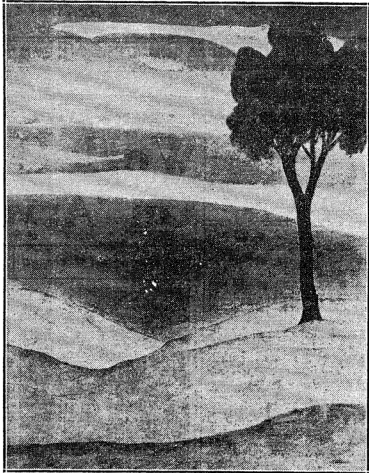
"Flushing Bay" as seen by American Jewish artist. One of the paintings on exhibit in the First Municipal Art Exhibition.