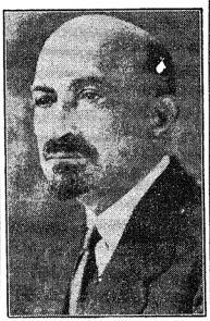
DR. CHAIM WEIZMANN