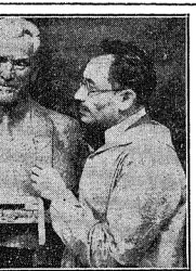
John J. Pershing, President Calvin Coolidge, Edwin Markham, Dr. John H. Finley, Eugene Debs, Alexander Graham Bell, Hudson Maxin, Samuel Gompers, Rabbi Stephen S. Wise, Abraham Cahan, Shmarya Levin, Rabindranath Tagore, and others. More of his works are on display in the National Gallery in Washington than any other sculptor's.

America beckoned. The golden gates of America beckoned to the rising young artist. He came here and settled in Washington. Champ Clark consented to pose for him, to give the young sculptor a start. The completed work proved so impressive that he had no difficulty in persuading other statesmen, and scholars and poets, to sit for him. Among these were Chief Justice Charles Evans Hughes, General other they drove off in a cab."