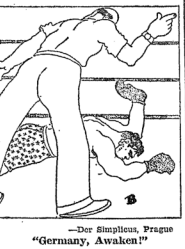
—Der Simplicity, Prague "Germany, Awaken!"