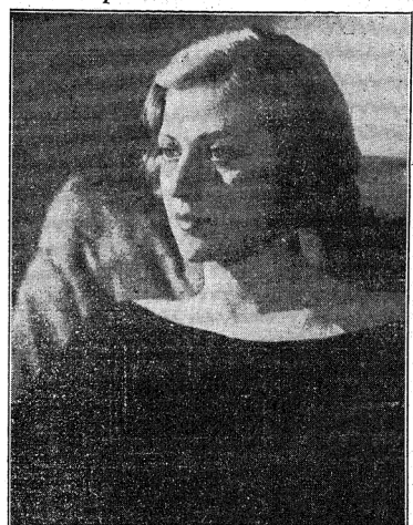
Stella Adler, daughter of the late Jacob P. Adler, will appear in the New Group Theatre production which will open in the Court Theatre March 21