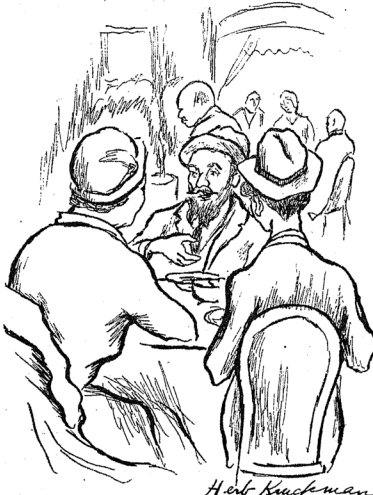
"Let him ask like a mensch and I'll introduce him to a nice girl."