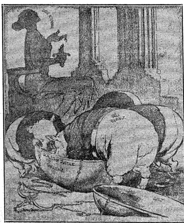
—Will Dyson in London Daily Herald.