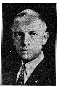
SENATOR BINGHAM

Germany to Palestine, the Ambassador said, "as far as is possible in my opinion, immigration into Palestine should be liberalized. In addition, on account of the situation particularly in Germany, there is more reason now, than ever be-