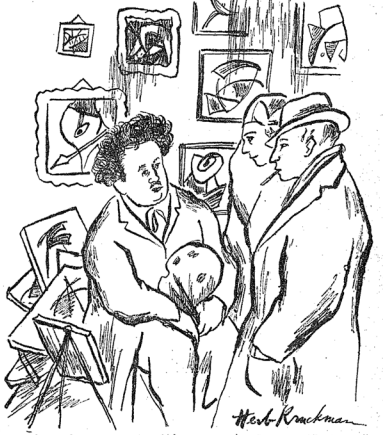
"I began by painting East Side scenes—then I went to Paris..."