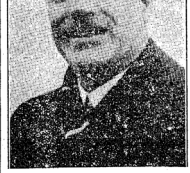
LORD DUDLEY MARLEY

Anti-Fascist, Nazi Outbreak Indicated as Aftermath