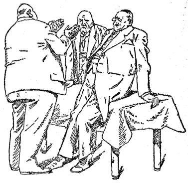
—Die Stunde, Vienna.

"Why are our exports declining? Because we don't deliver enough cloth for cash, and too much explosives on credit."