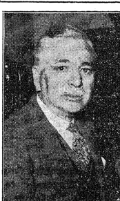
DR. HAROLD G. CAMPBELL

that the time is coming when we shall again have to strive for these inherent rights. We are becoming more certain of the fact that only in democratic and liberal principles lies our safety. We know full well that the rights of minorities are safe only in a democratic system of government."