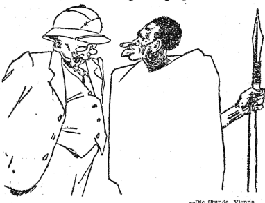
"... Now, Mr. Chief, if we could get your country for a colony, we in Germany would gladly adopt your race-rings, if only because they would facilitate leading our people about."