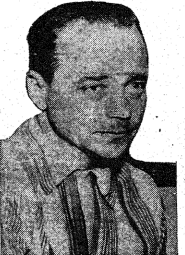
Chancellor Dollfuss