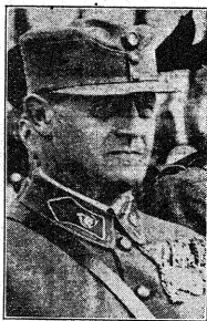
Major Emil Fey Who Led Austrian Troops in the Revolt