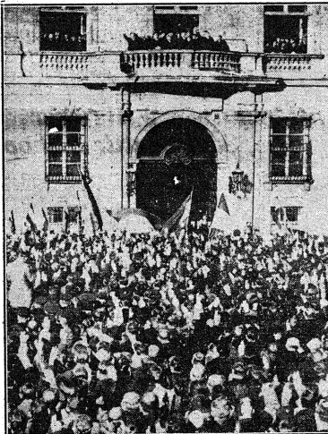
Chancellor Dollyus on the balcony of the Chancery recently responding to the demonstration of support of 10,000 Christian Social employees of the state railway.