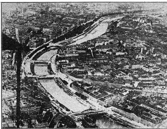
An air view of Vienna showing the Donau Canal winding through the Austrian capitol dividing in this scene the business district (right) from the residential and exclusive shopping sections and the theatrical district (left).