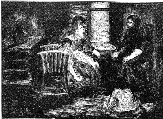
—From a monotype by A. Wolkowitz