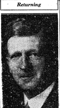
James G. McDonald

(Jewish Telegraphic Agency) JOHANNESBURG, South Africa, Feb. 8.—General Jan C. Smuts, war-time Premier of South Africa, member of the Allied Supreme Council and leader of the Union party, declared today in connection with the proposal of the South African Zionists to name a Palestinian colony Kfar Smuts that the "services of the small Jewish people to humanity were incomparably great and Western civilization still lives in the visions of the Hebrew prophets and seers."