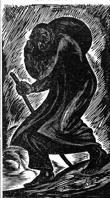
A new version of an old theme, done in woodblock by Isaac Friedlander

"Unification" of Germany and the abolition of States' rights, which is hailed by the Nazis as their outstanding achievement of the Hitler government, it does not lie in their mouths to insist that they may still mark their goods with the names of the defunct states. The case is squarely within the language of the Customs Court decision in the Van Dyk case ("there is no modern sovereign country known as Mesopotamia").