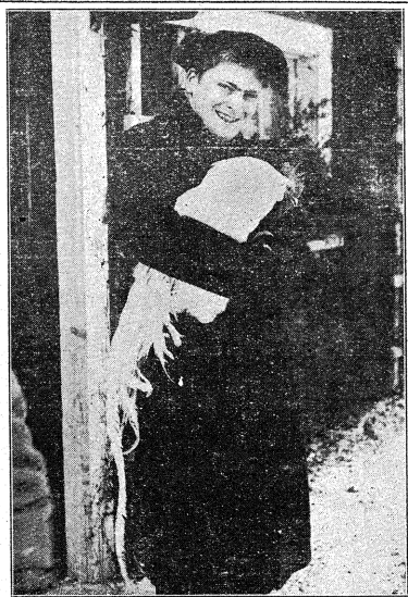
Yehud Menuhin, violin prodigy, on a N. Y. State farm.