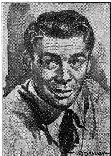
Playing in "Hi, Nellie" at the Strand Theatre