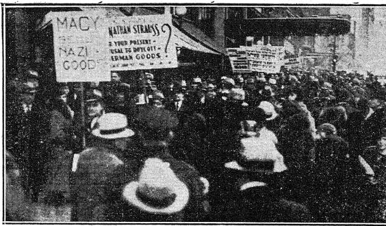
Crowds swarm around fifteen pickets seen above, a 200 ardent Jews protest Macy's German policy in the shopping rush hour Saturday afternoon.