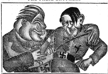
A French cartoonist's conception of Goering and Hitler