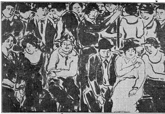
By A. Walkowitz, veteran painter of the modern school