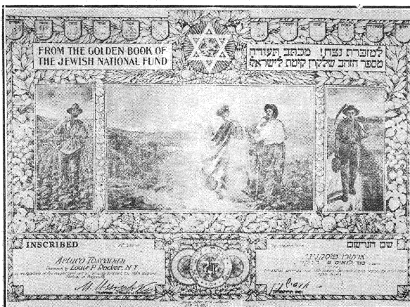
Inscription presented to famed conductor yesterday by the Jewish National Fund